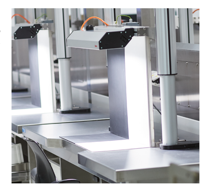
Attention to detail: The work tables with practical belly cut-out and height-adjustable work lights.