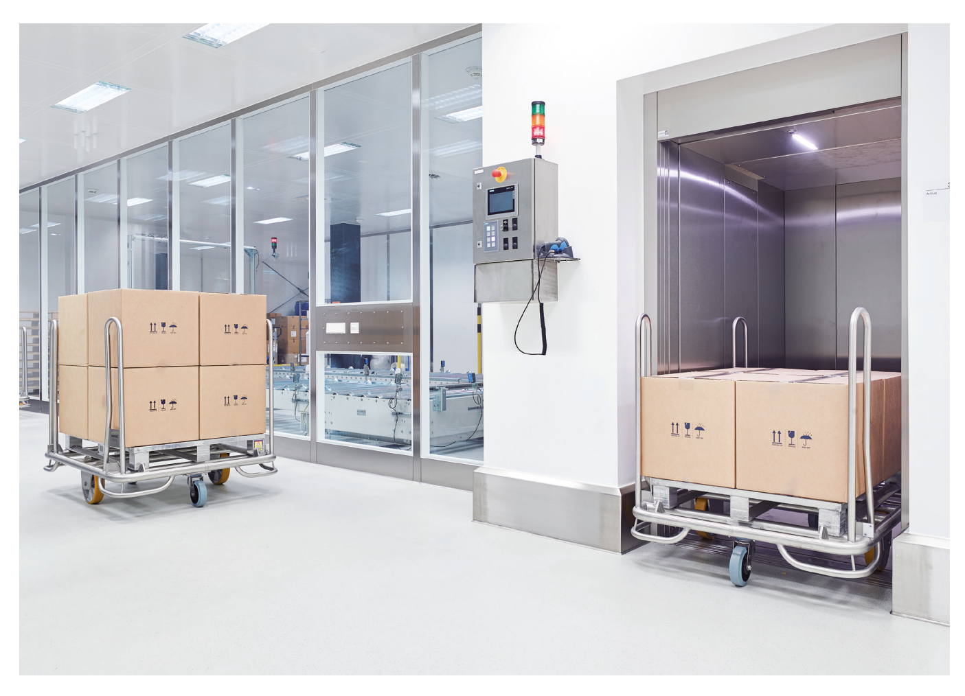
Here we go: The pallet transport cart is used to pick up the delivered products. The special dimensions enable practical transport in the lift. The four-sided impact protection is specially adapted to the plinth height provided by the customer.

"We can serve a wide range of cleanroom classes with our products."