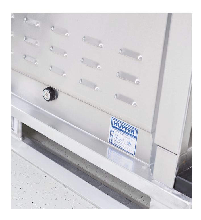
Great climate: The specially embossed gills ensure optimum air circulation and reduce moisture when stored in cold storage.