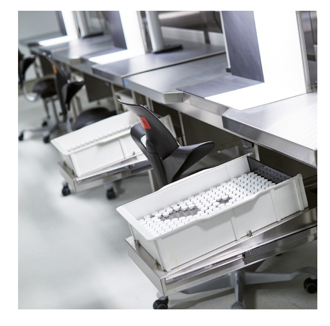
Thought along: The table pull-out is optimised to hold the polymer trays.