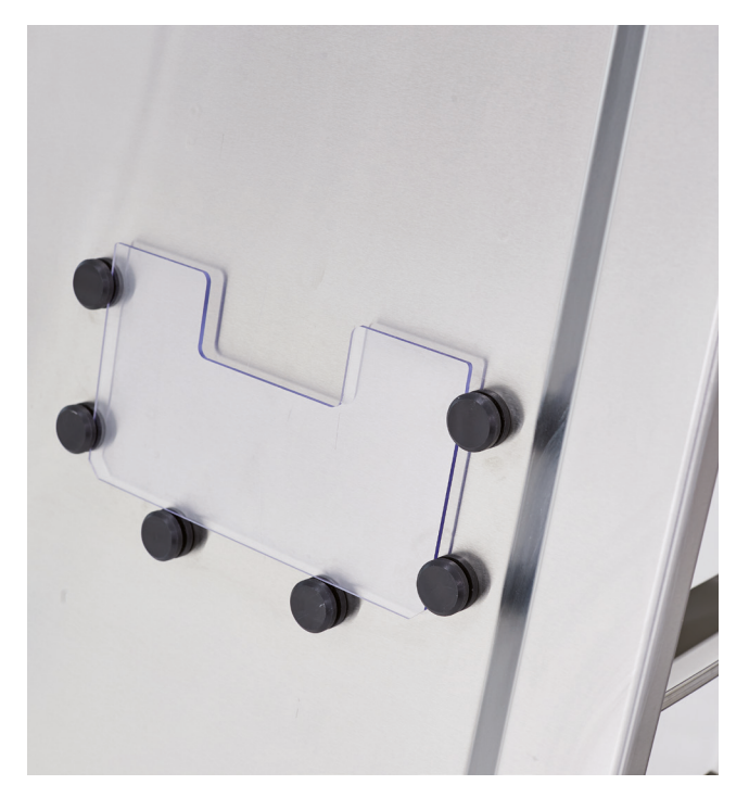
Practical: Holders for accompanying documents are installed outside and inside the container.