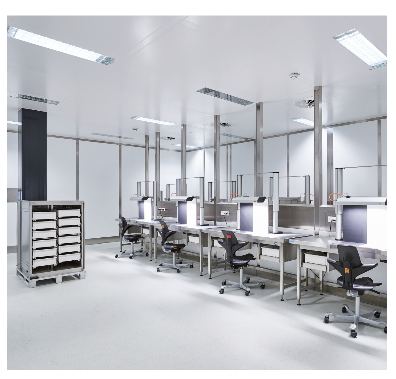
Customised: The inspection tables with adjustable working height and black and white inspection surface are customised Hupfer products.

Dieter Althoff, Hupfer Key Account Manager