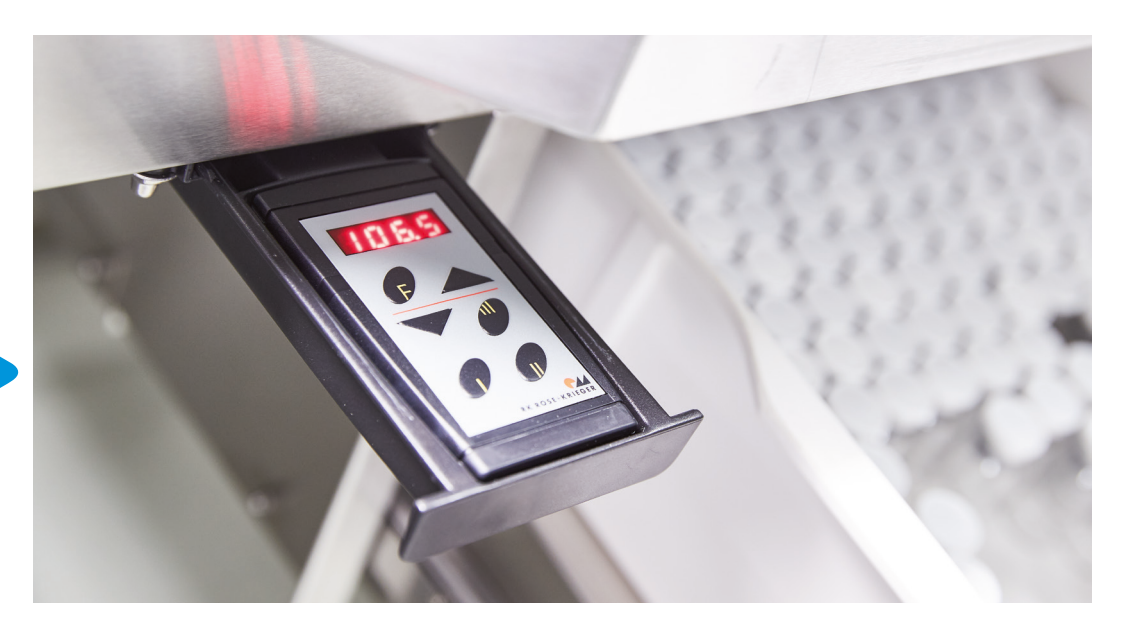
Ergonomically valuable: Infinitely height-adjustable work tables for an optimum working position.