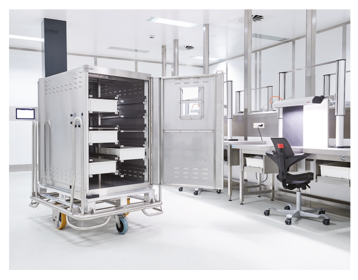
Well packaged: The closed transport container can hold up to 24 polymer trays. The container is optimised for automated goods transport (AWT).